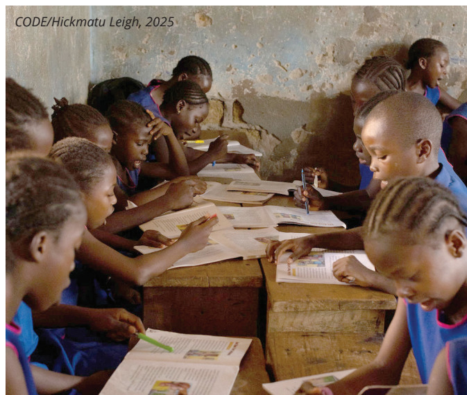
CODE/Hickmatu Leigh, 2025

These books arrive at a pivotal moment, as the TLFC midline results just revealed that the teaching methods