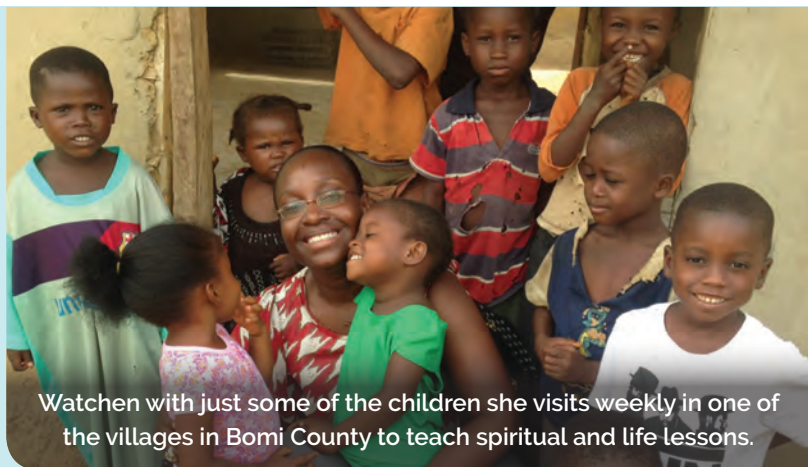
Watchen with just some of the children she visits weekly in one of the villages in Bomi County to teach spiritual and life lessons.

She knows first-hand the impact reading and writing can have on the lives of young people.